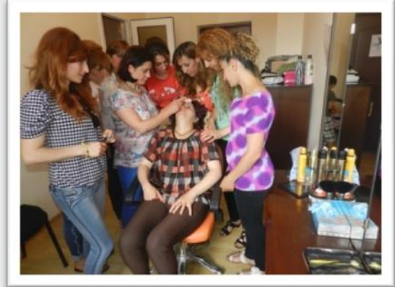
Make up course

This project is one of the most significant examples of Church response and joint effort with other actors towards community mobilization and empowerment. Under the Church facilitation the project availed space for different organizations to act together for public benefit and improvement of livelihood conditions of female led families.