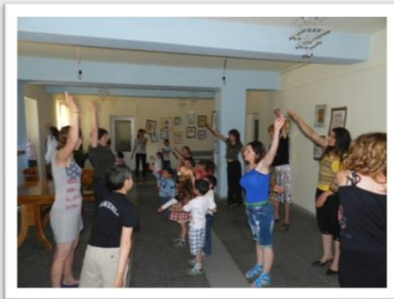
Dance classes for women and children