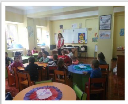
Day care centre